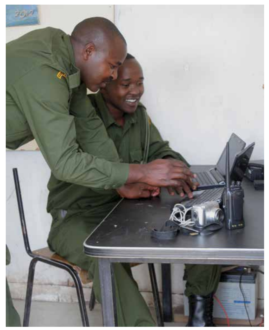
TOP RIGHT: A section of Solio rangers at the KWS training. BELOW: Checking data at the central operations room.

"We recently lost a black rhino mother and her calf. The mother was brutally killed by poachers who hacked off its horns. The eighteen month old calf was also brutally killed – eaten alive by lions. The system was meant to protect them. Once again it failed."